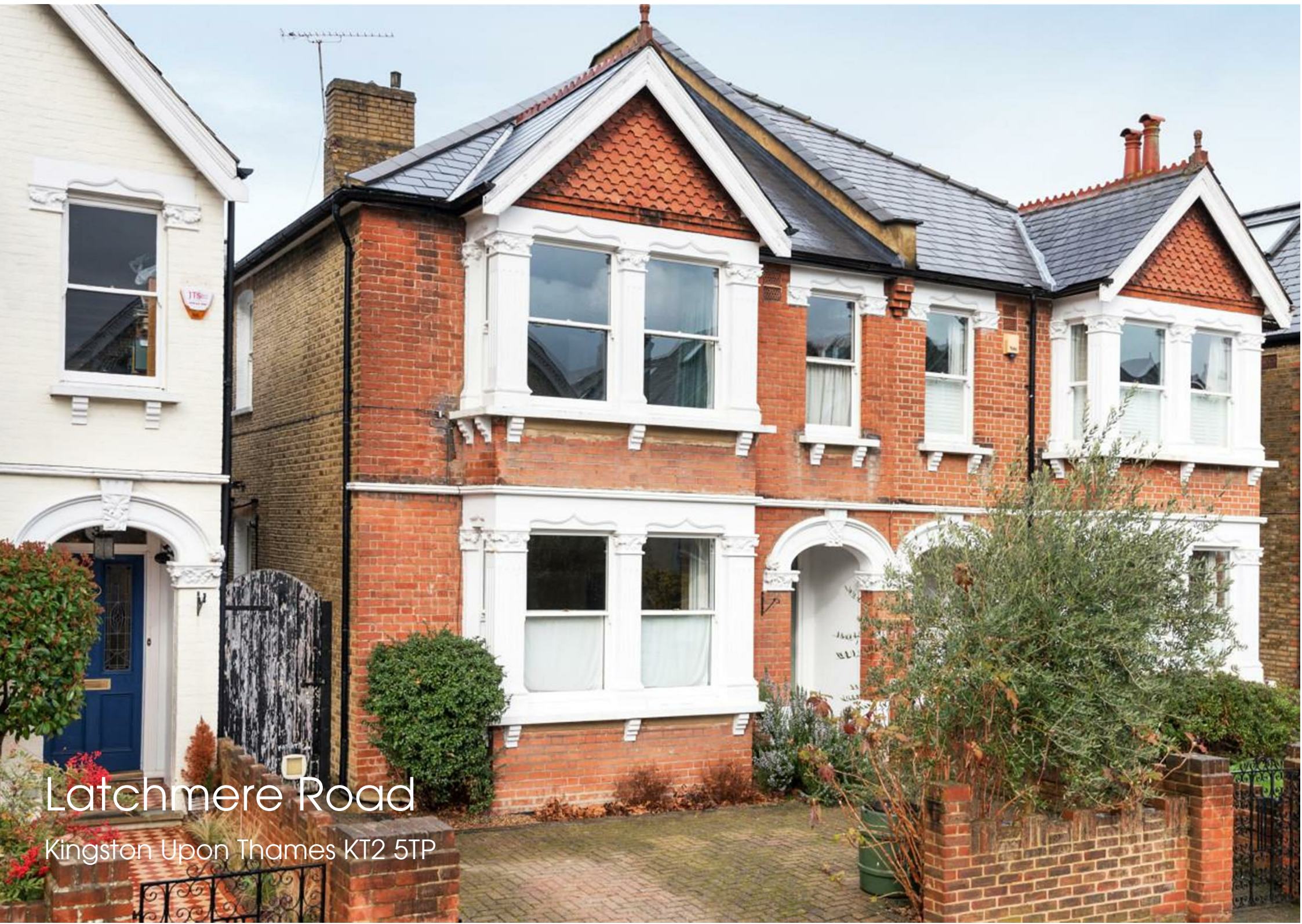
Latchmere Road Kingston Upon Thames KT2 5TP